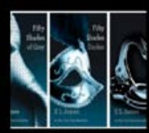
What the public thinks I do.